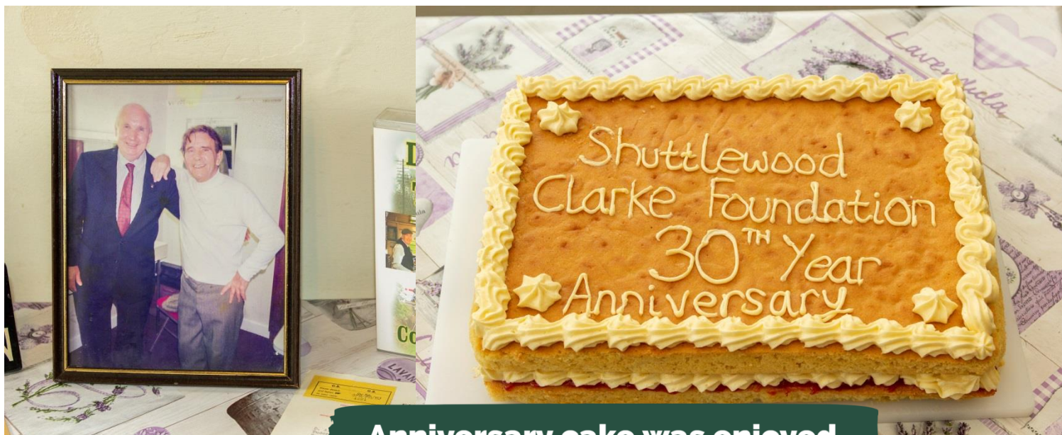
Anniversary cake was enjoyed