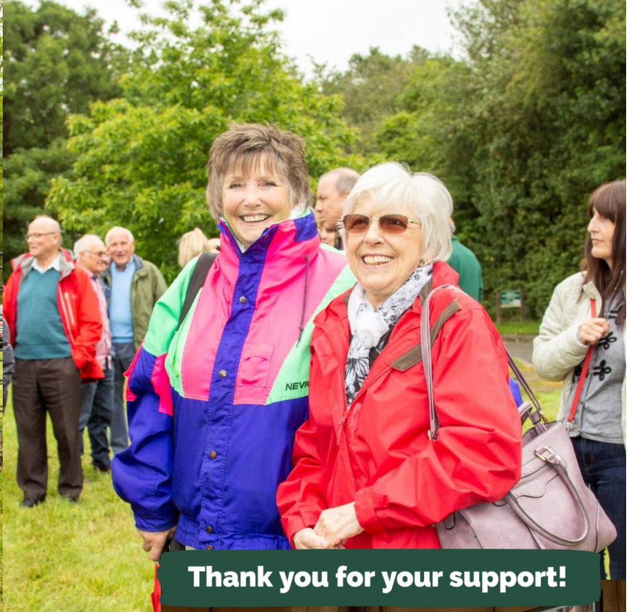
Thank you for your support!