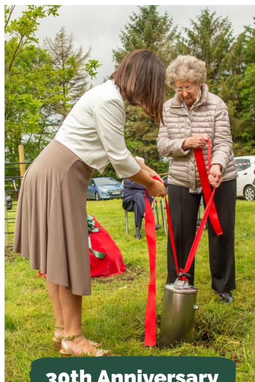
30th Anniversary Time Capsule Tree Planting