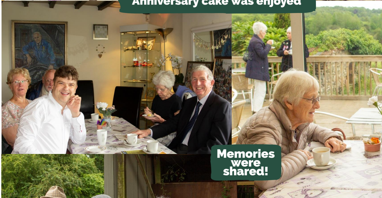
Memories were shared!